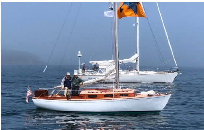
Lost in the fog