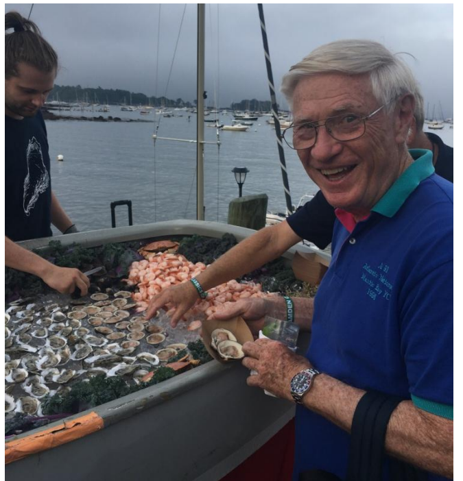
At the shellfish tub

Again, great shore parties at this 3 rd running of the Camden Classic cup – 67 entries, 4 Dolphins.