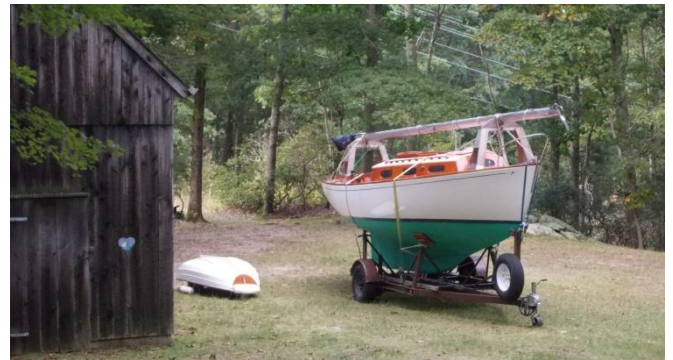
Home safe and sound...wait 'til next year

She was hauled on October 5 for the 5-hour trip back home to Old Lyme, Connecticut.