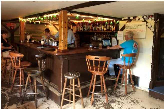
Keeping the website up to date

A popular gathering place for cruisers is the Pub downstairs at the Brooklin Inn, a short walk into town. As webmaster for the Dolphin 24 fleet it's important to update and stay in touch - beers, nachos, pizza - and webmaster work (note the laptop on the bar!). And the plaque on the wall helps maintain perspective