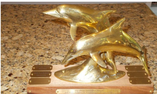
The Dolphins trophy - 2nd place