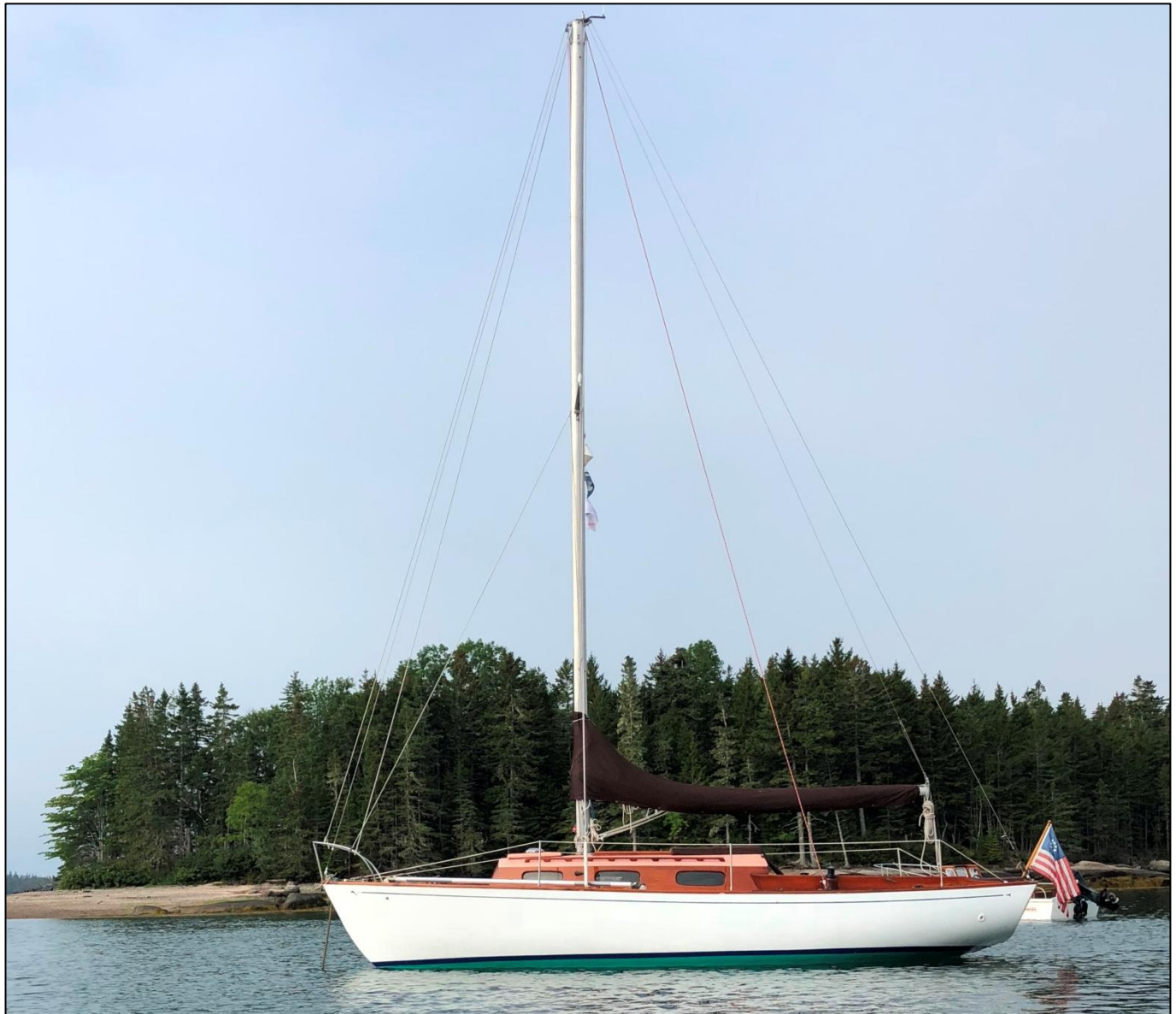
Marionette on her mooring, Brooklin, Maine

I would be remiss if I failed to mention that Marionette's 2018 season started on a high note. She won her 3 rd S&S Association Global Challenge award – this for winning the Dolphin 24 New England Championships at the Camden Classic Cup regatta in Camden, Maine. (A low note was being advised by the S&S Assoc. board that she would no longer be eligible to compete for this award in future.)